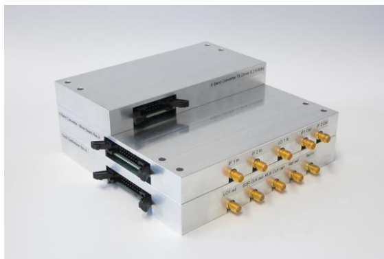
Modular version ready for integration in other systems

Your personal contact: Andreas Zutter zutter@precisionwave.com +41 32 513 57 52