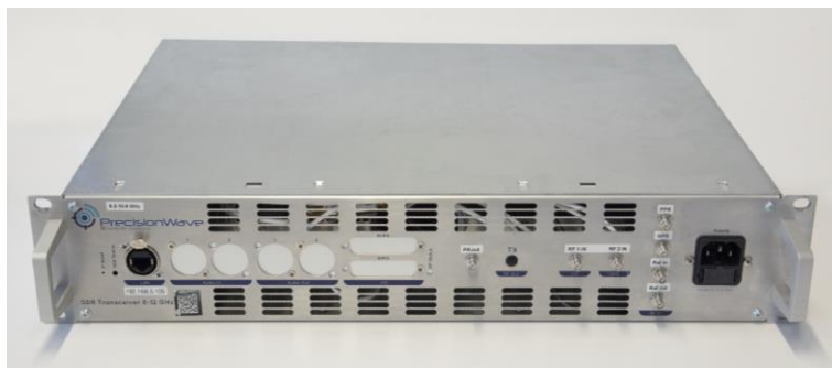
19" rack version as all-in-one solution: X-band radar, PSU, fuse and thermal management

Not fitting to your needs? XTRX-2x2 can also be delivered in other form factors or as bare modules. Please contact us for custom solutions.