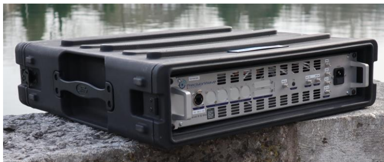
A transportable, ruggedized case is available: it perfectly fits your next field study