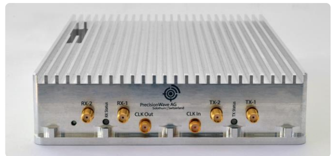
Our compact, fully integrated SDR module: Ethernet interface, low power consumption in a robust, shielded casing are just some of the features we offer.

Received echo signals are processed with a double-heterodyne receiver optimized for maximum dynamic range, high selectivity and excellent receiver noise figure.